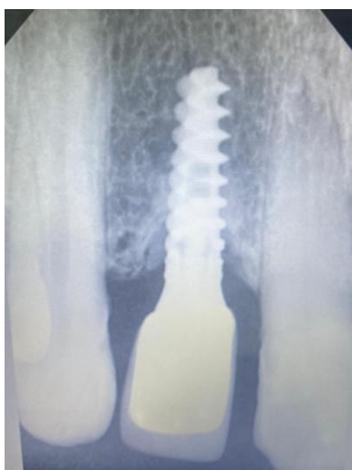
Fig 14. Post operative picture after prosthesis placement

Initial wax pattern ( Kronenwachs BEGO , Germany )was fabricated on the diagnostic cast taking support from the occluso-labial half of the adjacent abutment teeth covering only the