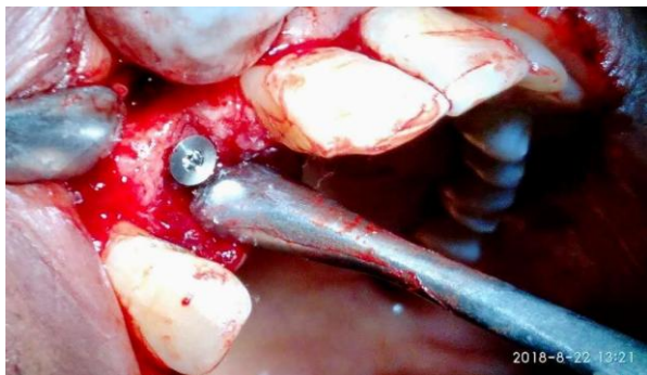
Fig 8. Picture of the place implant in the proposed site