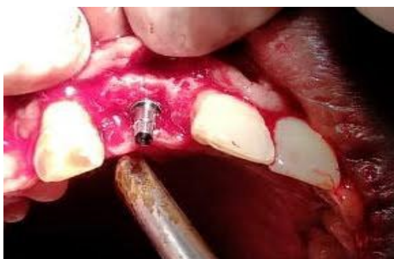
Fig 9 . Picture of the parallel pin in the proposed drill site