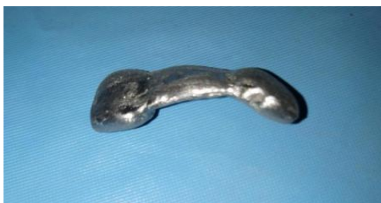
Fig 4. Picture of the metal custom made surgical guide