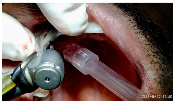
Fig 7. Picture of the metal custom made surgical guide in patient's mouth during drilling procedure