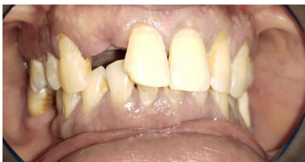
Fig 2. Pre operative intraoral picture