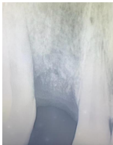
Fig 12. Pre operative radiograph