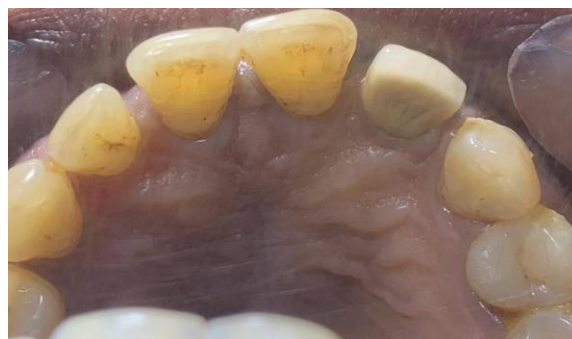
Fig 11 picture of the prosthesis after 3 months