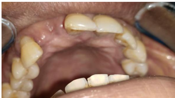
Fig 1. Per operative intraoral picture