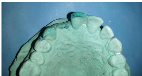
Fig 3. Pre operative Picture of the diagnostic cast