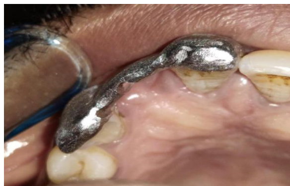
Fig 6 . Picture of the metal custom made implant surgical guide in the patient's mouth