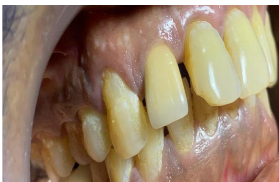
Fig 10. Picture of the Prosthesis placement after 3 months