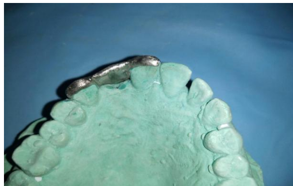
Fig 5. Picture of the custom made metal surgical guide in the cast