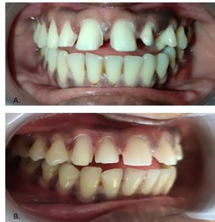
Photograph 3- A&B. Teeth Preparation

by leveling according to those grooves. Chamfer finish line was given interproximal and incisal reduction was done. A palatal wrap was created to provide proper emergence profile. All ceramic crown preparation was done with 22 and 24, more labial reduction was done with 22 as it was more labially proclined.