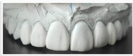
Photograph 2- Mock waxup from Right canine to Left 1 st premolar

Before starting the procedure Putty index was made using condensation silicone (Zhermack Zetaplus) on diagnostic wax-up for fabrication of temporary restorations.