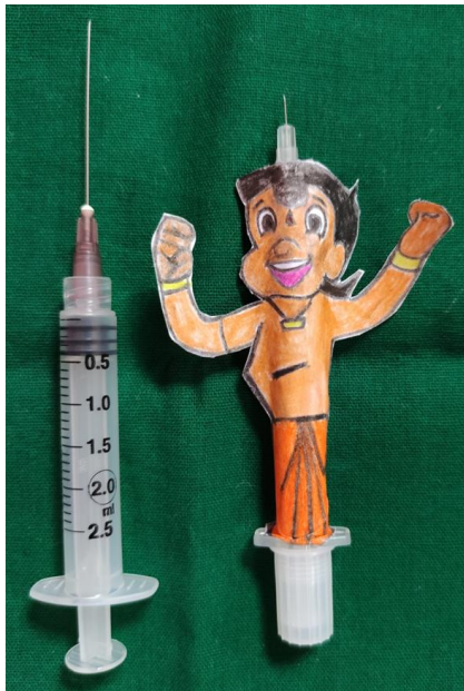
Fig. 1: Two syringes used in the study

It can be concluded that the thinner gauge Insulin syringe was found to be better than a conventional syringe for local anesthesia administration in children.