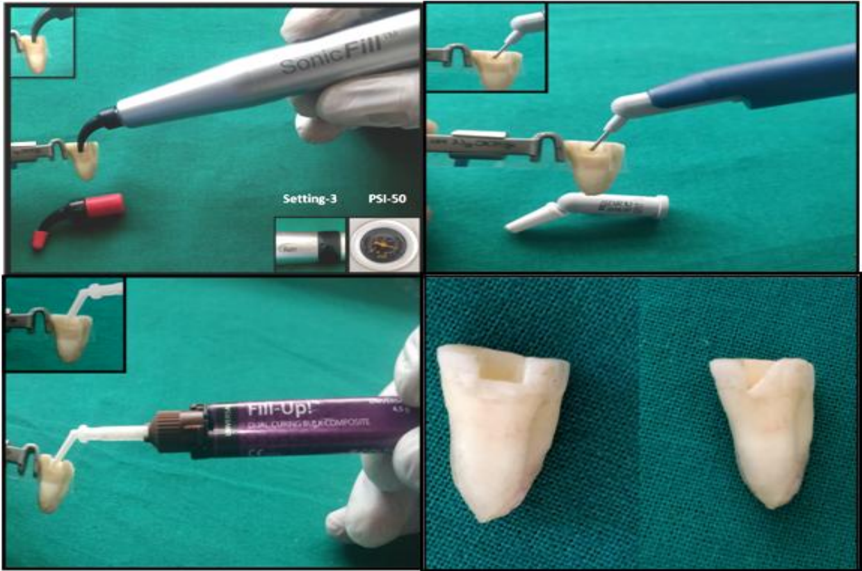
Figure 2: Restoring The Cavity Using A) Sonic Fill B) Sdr C) Fillup D) Filtek Z350