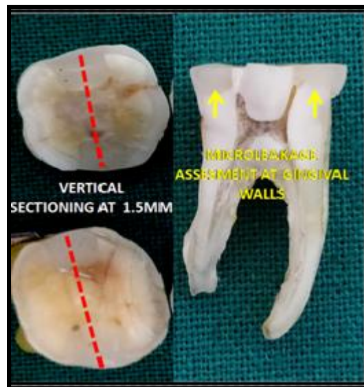
Figure 3 : Vertical Sectioning Of The Tooth Samples