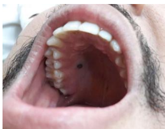
Fig- 1 Black discoloration on hard palate.

orally. There was no associated history of pain and any discharge.