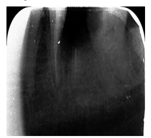
Figure IV- Intraoperative radiograph

examination (Figure-I), tooth #36 was found to be grossly carious with dislodged restoration involving distal as well as occlusal surface and it was tender on vertical percussion with the presence of a sinus tract and grade I mobility. On probing a clinical attachment loss of 6mm was found on distal root. Additionally carious 37, 46, missing 45, prosthesis with 26 were seen and overall oral hygiene of patient was poor. Radiographic examination (Figure-II), revealed improper root canal treatment with 36. A radiolucency extending to cervical third of the distal root and even approaching furcation area of the 36 was observed. Radiolucency involving enamel dentin approaching pulp on mesial side of 37 was also seen. On the basis of history, clinical and radiographic examination, a diagnosis of Persistent apical periodontitis was made with respect to tooth #36. Since the extent of decay made the tooth nonrestorable, the patient was explained about the condition and prognosis of tooth with feasible treatment options including extraction and placement of dental implant. However, he opted for hemisection followed by fixed dental prosthesis over other treatment options. The treatment planned included