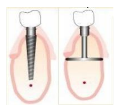
Fig 4 minimum bone support required for basal implants (right) compared to conventional implants