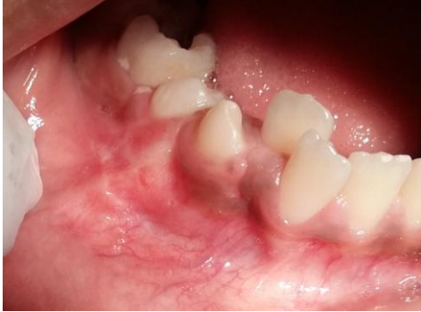
Figure 3: Two years post-operative photograph

However, the muscle may pose discomfort due to a rare aberrant attachment on the alveolar ridge via a thick and wide frenum in the molar region, near its