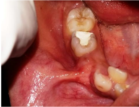
Figure 1: Abnormal buccinator attachment on the buccal side of the mandibular alveolar ridge

adrenalin), the portion of the buccinator muscle attached to the alveolar ridge was excised with an