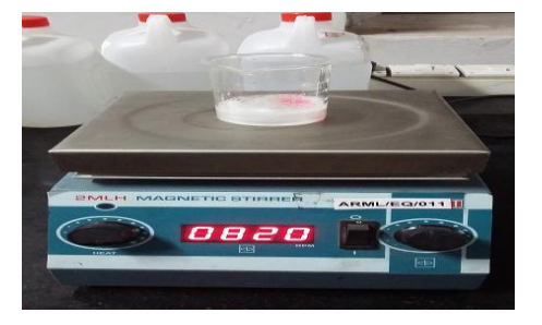
Fig 3. Magnetic stirrer bath

Phytic acid also known as inositol hexakisphosphate, is the major storage form of phosphorus in plant seeds and bran that contributes in a variety of cellular functions. It is also found in mammalian cells, with a concentration ranging from 10 to 100 mmol/L.<sup>9</sup> IP6