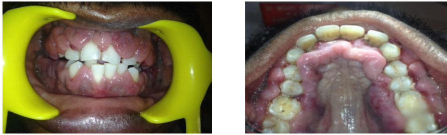
Fig. 1 : Initial intra operative view Fig. 2 : Intraoral view showing palatal petechia