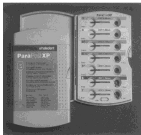
FIGURE 1 : PARAPOST X SYSTEM

To enhance the features of the existing Para Post system, Fiber White has longitudinally arranged glass fibres. The post is essentially parallel and has small steps for