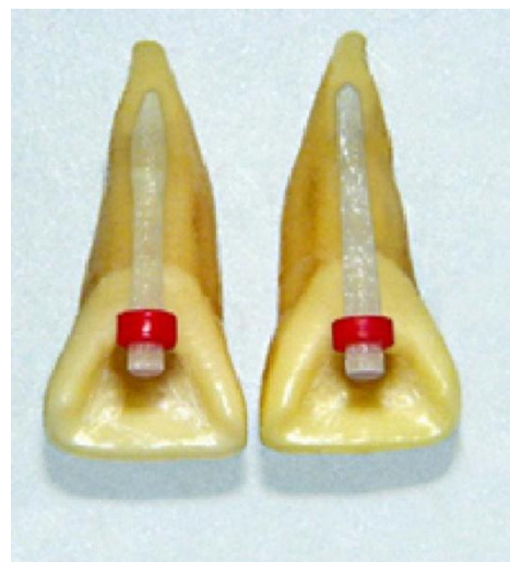
FIGURE 5: LUSCENT ANCHOR POST

Luscent Anchors posts can homogeneously attach to the canal and core material, creating a monobloc for exceptional strength and longevity. The resulting post and core is retentive and anti-rotational because sound radicular and coronal structure is maintained. 15 They reinforce thin walled roots through resin bonding internal root splinting. 16 The integral bonding of Luscent Anchor to composite core/crown complex provides durable support with natural background hues for esthetic restorations. Figure 5 shows Luscent Anchor Post system 15