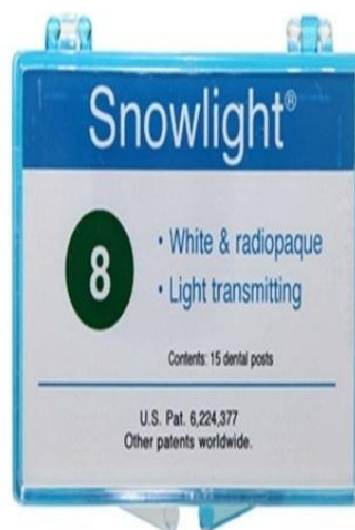
FIGURE 3: SNOWPOST

Innovative systems have recently been developed for reconstituting roots with overly flared canals caused by caries or excessive endodontic preparation and to rehabilitate aesthetically and structurally weakened teeth. These include the light transmitting posts and their main purpose is to achieve union between the remaining dentine and a light-cured composite to restore the lost bulk and original strength of the root thereby functioning as a dentin replacement and structural reinforcement. 11,13