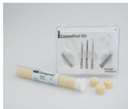
FIGURE 8: COSMOPOST

The posts, as manufactured, have a relatively smooth surface and are subsequently treated to roughen the surface, which increases the bond strength between the post and core, whether heat pressed or luted. Figure 8 shows Cosmopost Ceramic post system.