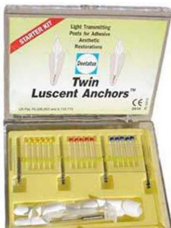
FIGURE 6: TWIN LUSCENT ANCHOR POST

It has a low modulus of elasticity of 20.1 GPa and a flexural strength of 579 MPa. It has a light transmission capacity of 11.9 Mw/cm. Figure 6 shows Twin Luscent Anchor Light Transmitting Post. 17