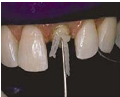
FIGURE 7: RIBBON FIBRE POST

permitted the use of all-ceramic restorations in situations, where previously only metal-reinforced restorations would have been placed. The use of ceramic to provide a core and post retention continues the idea of using a tough but aesthetic material to support all ceramic units without affecting their optical properties. The introduction of zirconium oxide ceramics has provided a material with over twice the flexural strength of aluminous ceramic systems, which is therefore able to be used to construct posts of realistic diameters. 11