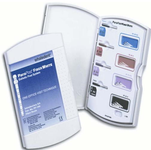
FIGURE 2 : PARA POST FIBRE WHITE SYSTEM

White post is antirotational and has two rounded sections to help in retention of the core material. It is available in diameters of 1.14 mm, 1.25mm, 1.4 mm and 1.5 mm. Each post has a removable color-coded ring around the head for identification. Figure 2 shows ParaPost Fibre White System. 11