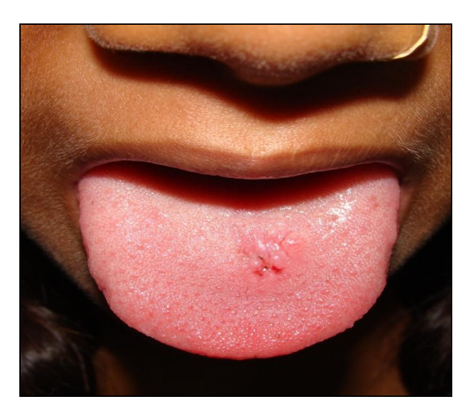
Figure 3: Post operative photograph