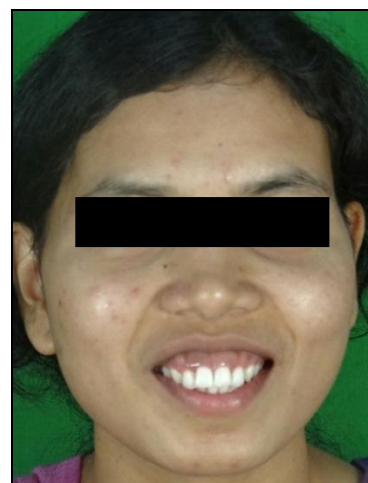
Fig 1: Facial Profile Pre Operative Anterior View

After clinically examining the patient it was found that the overjet was not enough to surgically rotate the anterior maxillary segment clockwise by anterior maxillary Osteotomy and to push it posteriorly to reduce proclination of maxillary anterior teeth and to correct the open bite. Therefore both the lower first premolars were extracted and the anterior segment was retracted