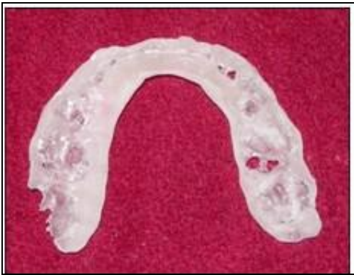
Fig 6: Fabricated Occlusal Splint

Three months after surgical procedure it was found that approximately 1mm residual space was left distal to all canines, so post surgical orthodontics was performed for 3 months for residual space closure and minor leveling and alignment. Short class 2 elastics were given on both sides with class 1 elastics in the lower arch. The case was deboneded after 3 months of post surgical orthodontics.