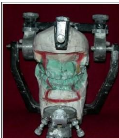
Fig 5: Model Cast Mounted On Hanau Articulator

first premolar to premolar .The Mucoperiosteum was elevated through this incision to