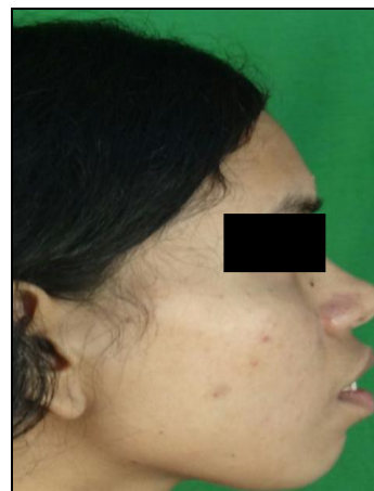
Fig 2: Facial Profile Pre Operative Lateral View