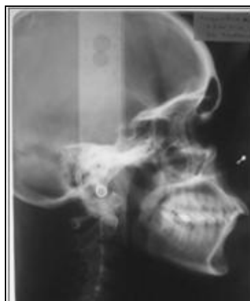
Fig 4: Pre Operative Lateral Cephalogram view

intubation, local infiltration with 2% lignocaine Hcl with adrenaline 1: 80000 as done in maxillary vestibule. Standard Cupar incision was given from