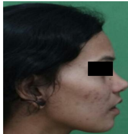
Fig 8: Facial Profile Lateral View Post Operatively