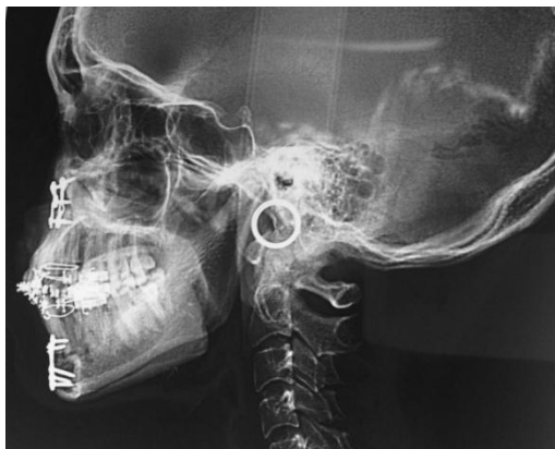
Fig 10: Post Operatively Lateral Cephalogram View