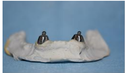
Fig 4. Mandibular copings