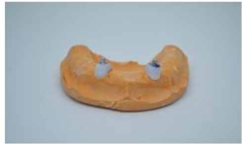
Fig 3. Wax pattern for mandibular copings