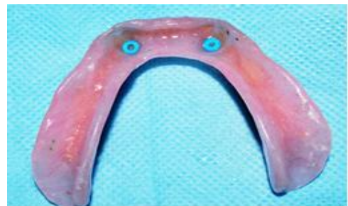
Fig 6. Mandibular denture with elastics picked up