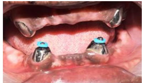
Fig 5. Cemented copings- intra oral view