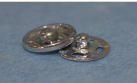
Fig 2. Metal press button