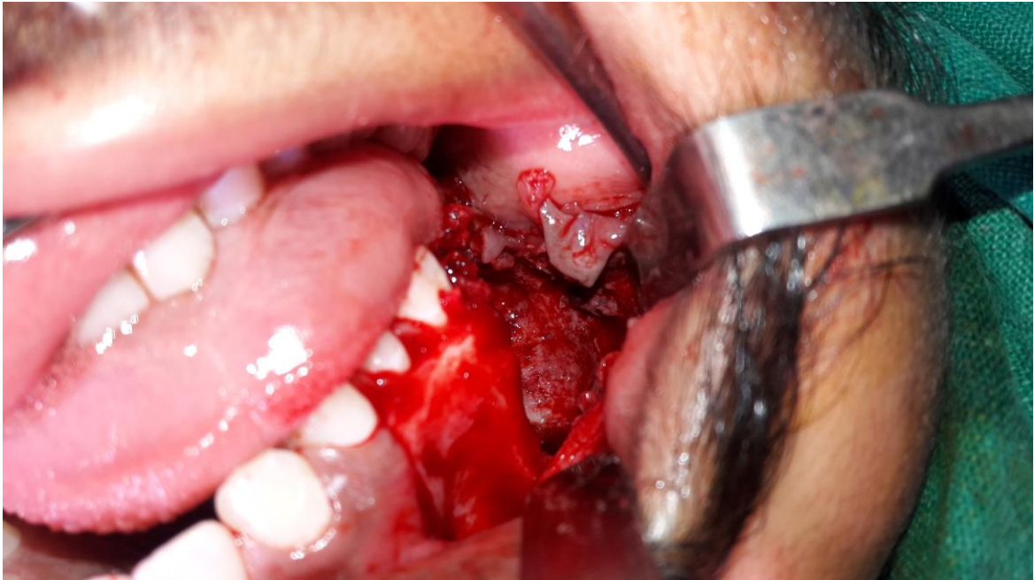
Figure 3: Exposure of the odontome during surgery