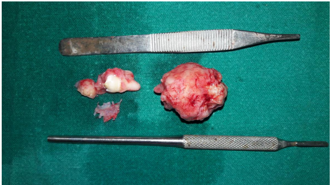
Figure 4: Excised specimen along with the unerupted tooth