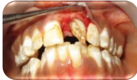
Figure 2: Incisions given and mucoperiosteal flap reflected, fracture extending subgingivally

the fractured tooth with resin-based composite or full-coverage crown. Enduring aesthetics are obtained since original anatomic form of tooth, color, and surface texture are preserved. It is adequately simple technique and results in favourable psychological patient response. 5