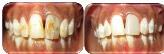
Figure 6: Postoperative view on the 10th day and after 6 months of reevaluation

Fracture of anterior teeth after trauma adversely affects the psychological well-being of a person apart from causing discomfort and pain. Restorative design of such fractured teeth is influenced by the complexity and extension of fracture. Reattachment of the tooth is a possibility when the broken fragment is intact and available. It offers diverse benefits over conventional