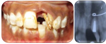
Figure 1: Pre-operative view: clinical and radiograph showing coronally fractured left maxillary central incisor