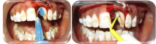
Figure 4: Etching of fractured tooth and application of primer after rinsing and drying

fractured tooth circumferentially it was determined that the biological width was not violated and that bone recontouring via osteoplasty would not be indicated or required as long as the restorative margin were placed at or above the level of the cemento enamel junction.