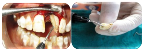
Figure 5: Application of flowable composite to the fractured tooth and the tooth fragment

attachment (Figure 5). After receiving a slight layer of resin, the fragment was repositioned and kept in position until light polymerization was completed. The surgical site was closed, and interrupted sutures were placed. Coe pack dressing was given and patient was recalled after 10 days for re-evaluation and suture removal. The occlusion was examined and the patient was sent after instructions to avoid exerting masticatory or other loads on this tooth and to follow regular oral hygiene procedures. Suture removal was done, postoperative view at 10 th day shown in figure 6.