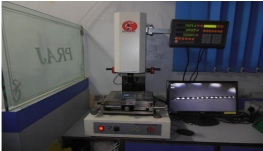
Fig 1 : Vision inspection system

drawback to this method is that the position of the apical constriction or the major foramen cannot be determined. 6,7,8,9 However, it has been reported that it