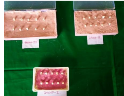
Fig 2 : Samples with access open & mounted in fresh alginate

(which corresponds to poor accuracy with electrolytes) was overcome by the introduction of the third generation apex locators, such as Root ZX (J Morita