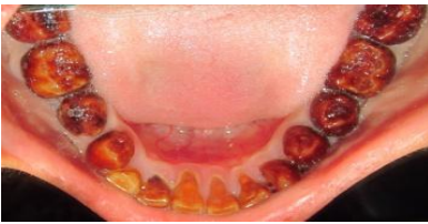
Fig 1: Pre-Operative Photos