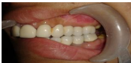
Fig 11: Final prosthesis

kept in diagnostic and observational period of 6 weeks before the definitive restorative phase of rehabilitation started. A diagnostic wax up of full mouth restoration was carried out at increased vertical dimension for posterior teeth without the anterior segment of maxillary cast in place (fig.6). To produce standard effective cusp angles, the condylar and incisal guidance were set to condition 1. At this position, the diagnostic wax up was balanced in protrusive and lateral excursion. The anterior segments of cast were reassembled and condylar and incisal guidance were set again (condition-2) and wax up completed so as to generate posterior disclusion.