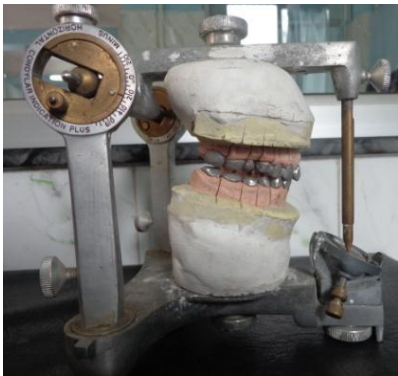
Fig 10: metal copings