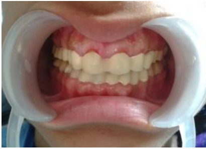
Fig 9: Temporary restorations