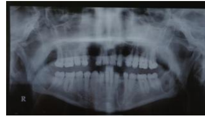
Fig.3: Post Opreative OPG