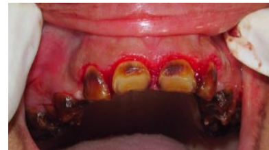
Fig 4: Crown Lengthening Was Done