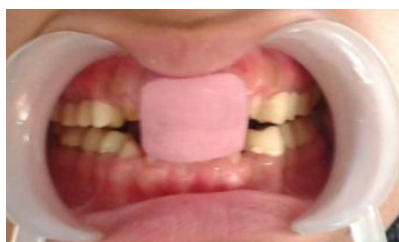
Fig 8: Right and left Temporaries as occlusal stop

examination permanent teeth present were 11, 12, 43, 14, 15,16, 17, 21, 22, 53, 24, 25, 26, 27,31, 32, 63, 34, 35, 36,37, 41,42, 43, 44, 45, 46,47. Gingival health of the patient was unremarkable and had a normal palatal arch. Past medical history of the patient was nonsignificant and the patient appeared to be well nourished with moderate height and built. Patient was advised for OPG, skull and chest X-Ray and full mouth IOPA radiographs. Skull and Chest radiographs did not reveal any significant findings. OPG revealed