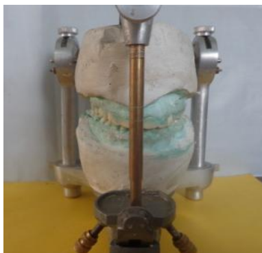
Fig 6: Diagnostic wax up