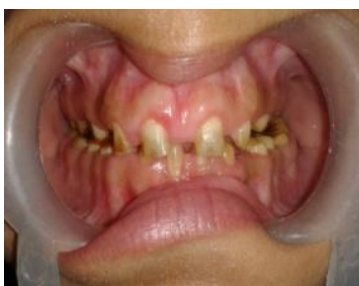
Fig 7: Mouth Preparation