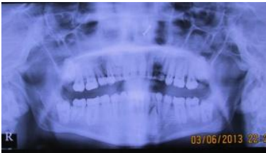
Fig 2: Preoperative OPG