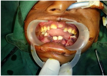
Fig -1 preoperative

revealed fall from auto previous day evening. There was a history of bleeding intraorally for which the