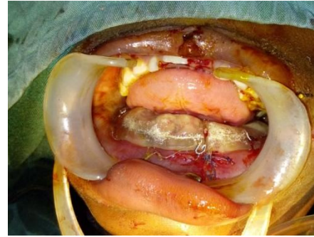
Fig -6 post operative

stabilized using bridle wire between the fractured segments. Cap splint was then positioned wrt the lower arch. 18 gauge needle was passed extraorally from below the lower border of the mandible wrt 83 and 84 region on to the lingual side of the oral cavity.(Fig 3) From cannula of needle 26 gauge stainless steel wire was passed and cannula was then removed. Now one end of 26 gauge wire was outside and another lingually. (Fig 4)Then the needle was reinserted intraorally through the buccal vestibule and taken out through the same point extraorally.(Fig 5) Then the wire end already present extraorally was reinserted into the needle and taken out on to the buccal side. The same procedure was done on the opposite side molar region and also in central incisor region. (Fig 6) Postoperative antibiotic treatment was started for 1week. Soft diet, avoidance of physical activities, and antibacterial mouth rinse were prescribed.