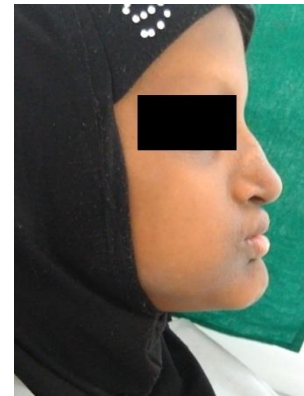
Figure 10: Post-operative Lateral view

prominent supra orbital ridges, sunken cheeks, hyperpigmented skin around the eyes, protuberant lips, and decreased lower facial height. Nails appeared normal.