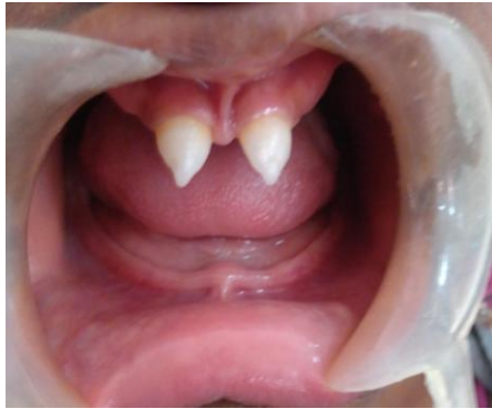
Figure 3: Pre-operative Intraoral view