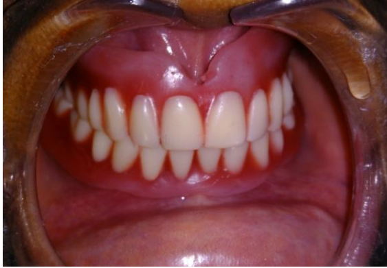
Figure 7: Trial Denture