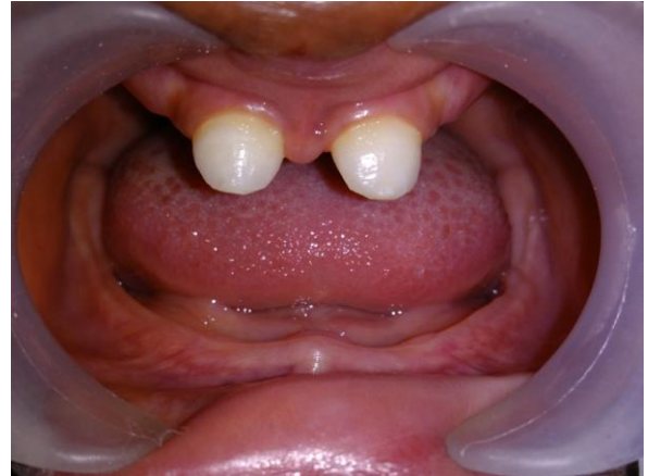
Figure 6: Sharp conical tips were reduced rehabilitation of ED patients must be on an individual basis, considering each patient's growth and developmental characteristics. Many treatment approaches have been reported and may include single crowns, fixed partial dentures (FPD), complete dentures (CD), removable partial dentures

The dental characteristics include anodontia or hypodontia of the primary and/or permanent teeth, hypoplastic conical teeth, and underdevelopment of the alveolar ridges. 3,4 When teeth are missing the alveolar bone in which they are ordinarily embedded does not develop well, leading to a reduced vertical dimension and a typical aged appearance in the face. 5,6 The deviation from normal facial growth of HED subjects tends to lessen with age when rehabilitated with functional and prosthetic appliances 7 . The Prosthodontic