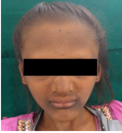
Figure 1: Pre-operative Frontal view