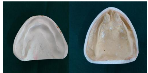
Figure 5: Primary Casts obtained from Alginate impression

some patients. The eyebrows, eyelashes, and other body hair may also be absent or sparse. Fingernails and toe nails may show faulty development and be small, thick or thin, brittle, discolored, cracked, and/or ridged. Extraoral manifestations include frontal bossing, depressed nasal bridge, protuberant lips, and hypotrichosis.