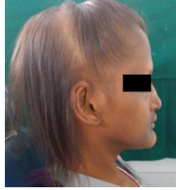
Figure 2: Pre-operative Lateral view