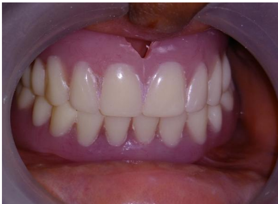
Figure 8: Final Prosthesis

(RPD), overdentures (OD), and implant retained prostheses. A removable prosthesis is often the treatment of choice for young patients with ED. 9 This article presents the early prosthetic rehabilitation for a child with hereditary ectodermal dysplasia associated with severe oligodontia in primary and permanent dentition.