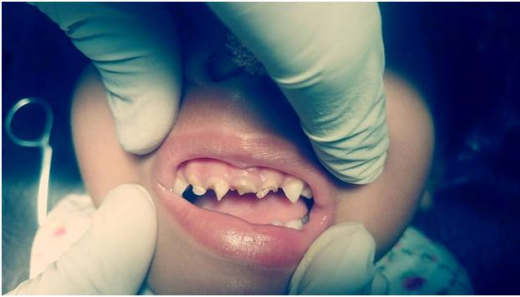
Figure 1-Pre-operative grossly decayed deciduous upper anterior teeth