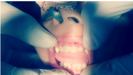
Figure 3- Composite build up of upper anterior teeth

procedure, patient was kept Nil-by-mouth for six hours and intravenous fluids were maintained. The patient was taken under general anaesthesia and intubated through nose. Throat pack was placed and intermittent suction was maintained to prevent aspiration. Access was gained into the root canals of 51, 52, 61 and 62 using arotor handpiece with simultaneous suction. Working length was determined using apex locator. The canals were enlarged till #25 K-file upto the working length. Biomechanical preparation was performed using rotary Ni-Ti files (Protaper system) upto F3 with EDTA and sodium hypochlorite irrigation. The canals were then flushed with normal saline and later copious irrigation was done in the canals using chlorhexidine. Then the canals were dried using absorbent points and obturated with Metapex obturating material. Fiber post was selected to support the restoration as it adapts well to the root canal anatomy. The fibre post which fitted most snugly to the canal wall was selected for each of the teeth. The level of fiber