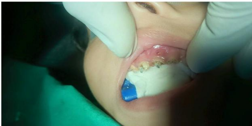
Figure 2- Placement of fibre-posts in the obturated canals.