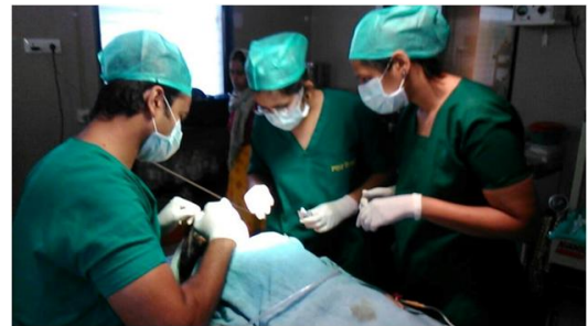
Figure 5- Treatment under General Anaesthesia.

post was kept till the crest of the alveolar bone so that it would exfoliate along with the teeth. The approximate level of fibre post insertion in the canal upto the crest of alveolar bone was verified radiographically pre-operatively. The fibre post was luted using 3M Glass Ionomer luting cement. Core build up was done using 3M light cure Composite resin. The occlusion was checked. After removal of occlusal interferences, final finishing and polishing of the restoration was performed using Shofu Composite polishing kit.