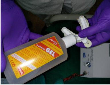
TRAY SELECTION AND MANIPULATION