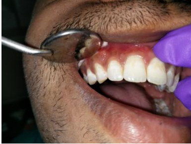
ISOLATION IRT 13,14