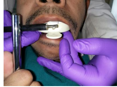
Iontophoresis unit set up in patient with dentinal hypersensitivity with negative electrode attached to the handle of the tray and positive electrode held by the patient.

it may discourage a person from maintaining proper oral hygiene further deteriorating the oral health. 1