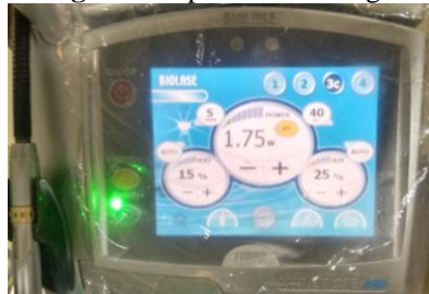
Fig 2: Laser settings