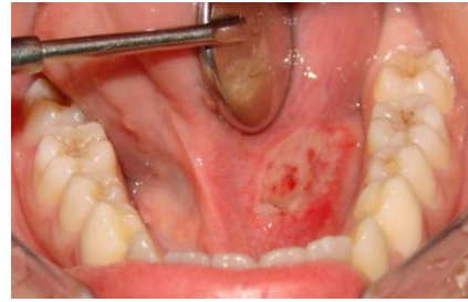
Fig 4: Immediately post-op