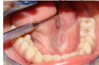
Fig 5: 3 month follow up