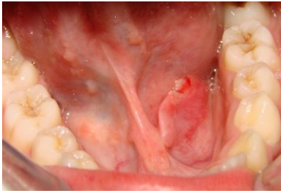
Fig 1: Pre-op intra oral image