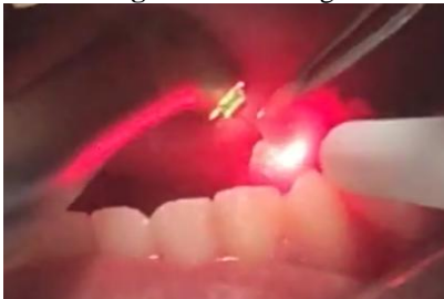
Fig 3: Lesion excision using ErCr:YSGG laser