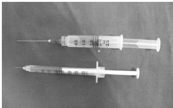
Figure 1: two types of syringes used in study