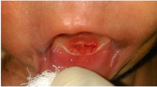
Fig 2: Post extraction socket of the mandibular natal teeth with control of bleeding