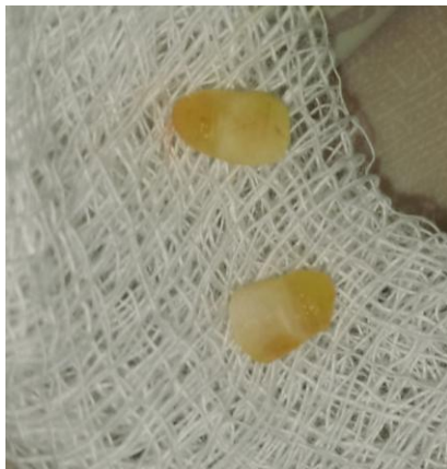
Fig 3: Natal teeth showing absence of root formation

The appearance of gingiva was normal. There was no ulceration found on ventral surface of tongue. There was no association of any soft tissue and hard tissue abnormality. There was no relevant familial history of any similar oral manifestation. Child was normal without association of any syndrome. A diagnosis of natal tooth in mandibular anterior region was given.