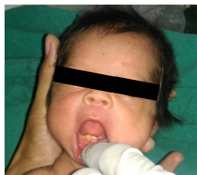
Fig 1: 8 days old infant with two mandibular natal teeth

An 8 day-old female infant was referred to the department of Paedodontics and preventive Dentistry for K.M Shah Dental College and Hospital with complaint of teeth in the lower jaw since birth. On medical examination baby was pre term twin with 1.4 kg weight. Intraoral examination revealed two crown of the teeth in the mandibular anterior region [Fig 1], which are yellowish brown in color and manifesting the grade II mobility. The crown size was normal and resemble to primary incisor.