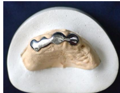
Fig. 6: The cast copings with the keeper incorporated into the splinted single unit restoration