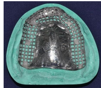
Fig. 12: the cast metal framework fabricated was verified for clearance over the magnetic metal placed on the keeper

By this time, the mobile lower anterior teeth were extracted and a partial denture was fabricated for the lower anterior teeth. The metal denture base was cast and tentative jaw relation was completed. Esthetic wax trial was done (Fig. 13a, 13b). The magnetic metal was then picked up in the upper complete denture using auto-polymerizing acrylic resin (Fig. 14,15).