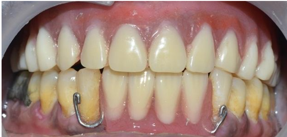
Fig. 15: Rehabilitated appearance of the patient with the magnetic overdenture in the upper arch against lower partial denture