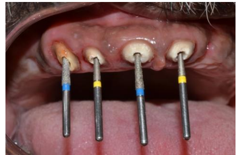
Fig. 2: Post space preparation of upper anteriors with tapering burs used to evaluate parallelism