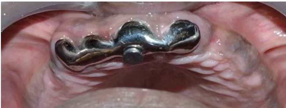
Fig. 14: the magnetic metal was seated over the keeper intra-orally after cementation of the cast coping and autopolymerizing acrylic was used to pick it up in the processed upper complete denture prosthesis