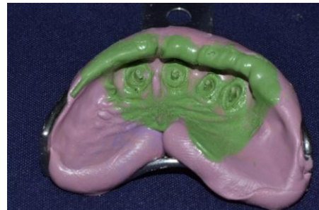
Fig. 3: Post- space impression made with details of the preparation margins and reduced teeth