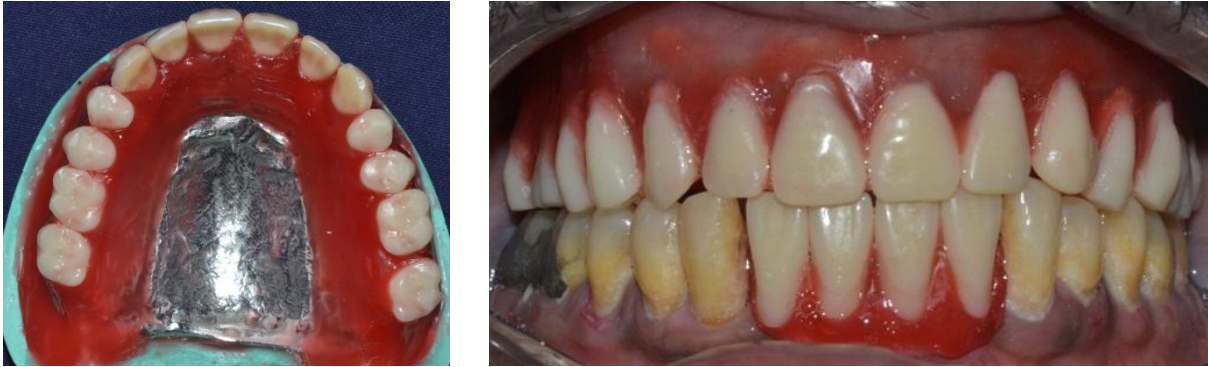
Fig. 13 (a,b): Esthetic wax trial done with the metal denture base incorporated inside upper arch trial denture