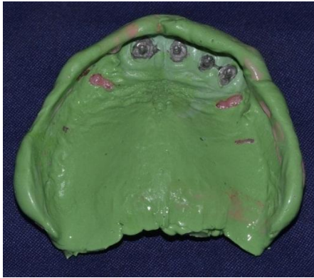
Fig. 8: The casting picked up in the secondary impression of the upper arch