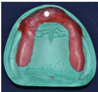
Fig. 10: The magnetic metal was placed over the keeper to verify the amount of clearance needed for acrylic in that region