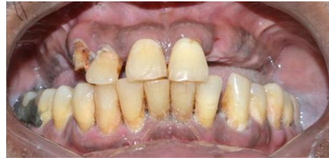
Fig. 1: Pre-operative intraoral view

roughened and coated with light bodied impression material and picked up with a putty wash impression in