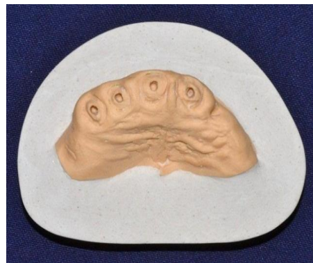
Fig. 4: Cast of the prepared teeth and their post spaces