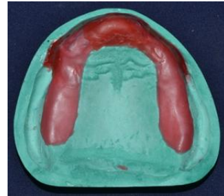
Fig. 11: Additional relief in the anterior region applied before duplicating the cast in refractory material