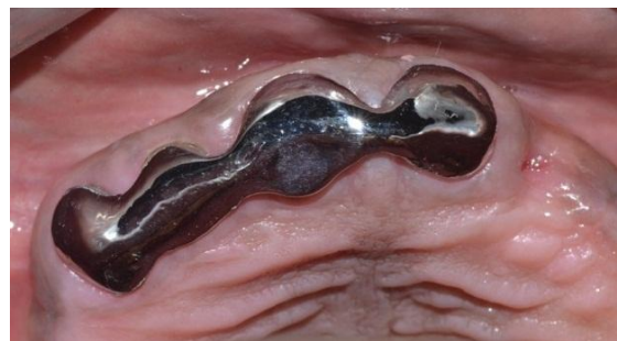
Fig. 7: The casting tried for fit intra-orally