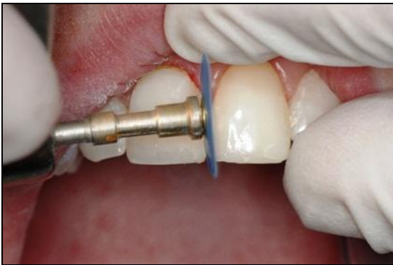
Fig:-1 Inter proximal enamel reduction with Diamond Disk

B-Diamond disks- They are abrasive diamond-coated disks available in varying thicknesses and grits, similar to strips. They can be single/double-sided and are used with contra angled handpiece (Fig:-1). It provides the smoothest enamel surface with polishing after IER, but if not used properly may leave deep undercuts on the enamel and sometimes can become dangerous while working in close proximity to a patient's tongue, cheeks and lips.