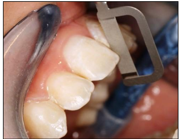
Fig. 3. "Ortho-strip" with a holder

D-Ortho-strips- These are thin, semi-flexible strips used with a holder (Figure 3). Intensive Proxo shapes are flexible thin blades that removes a small amount of the intermolar enamel to provide banding space if separation has not been effective. This technique requires more time than ARS, but the results obtained are more predictable, and the enamel surface obtained is smoother than that achieved when using burs