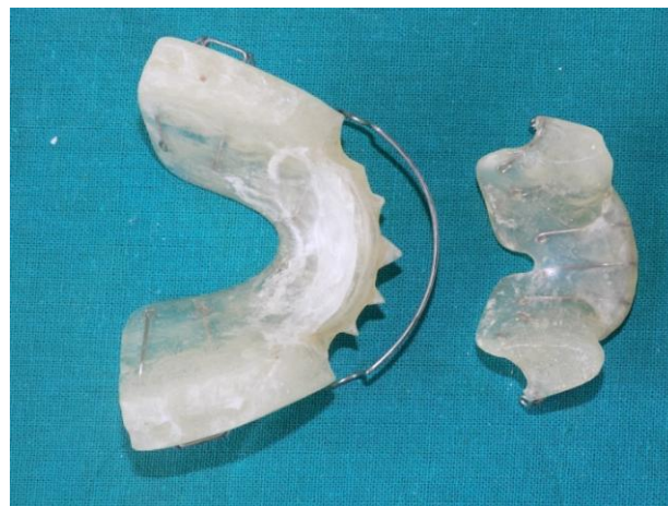
Fig 3- Twin Block Appliance

advantages include esthetic, easy to repair. It is suitable for mixed dentition as well as deciduous dentition. 13 There were several studies where they have documented the ability of twin block to produce significant skeletal as well as dentoalveolar changes which in combination correct Class II malocclusion. 14,15