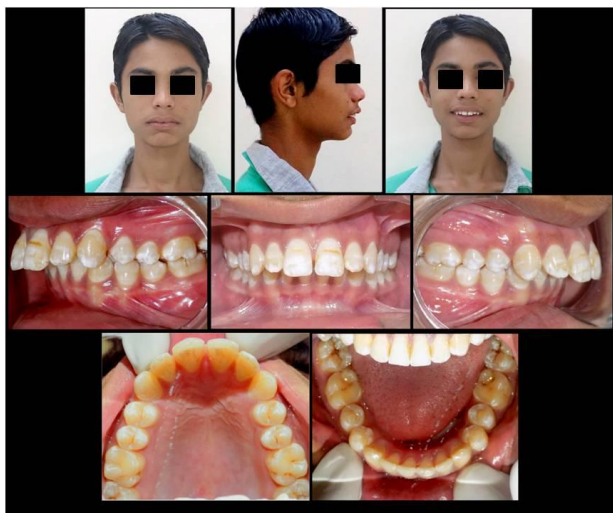
Fig 1- The pretreatment intra-oral and extra-oral photographs