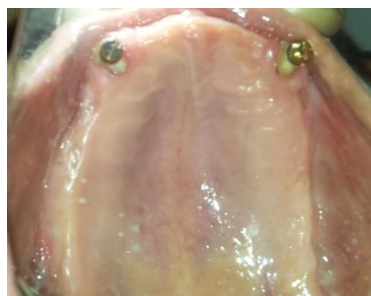
Fig 3: Post analogues were cemented before secondary impression

23, which were firm and had good soft tissue attachment and an ideal maxillary distance of 18.5mm. Routine clinical and radiographic examination( OPG & IOPA) was followed. Considering the patients chief complain as well as the condition of the oral cavity, overdentures with attachments in the maxillary arch was planned out for her, because of the presence of a deep under cut in the anterior region of maxilla in the alveolar process region bilaterally, therefore, it was decided that the maxillary denture will be flangeless, as the denture with a flange will