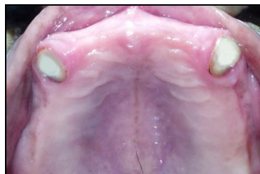
Fig 1: After RCT and crown preparation crown reduction

A 58 years old female patient reported to the department of Prosthodontics and crown and bridge, with the complaint of missing teeth because of which she was unable to chew food properly. And had bad look. The patient is a social worker by profession and was concerned mainly about the retention of the prosthesis because her previous dentures were ill fitting. Her medical history was non contributory. On extra-oral examination the patient had a concave profile with ovoid face form, and TMJ had no abnormality. On intra-oral examination, she had completely edentulous and favorable mandibular arch and also a moderately favorable maxillary arch with retained 13 and