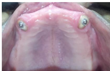
Fig 2: Cementation of posts