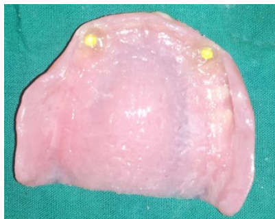
Fig 5: Intaglio surface of final denture with metal housing and retention caps