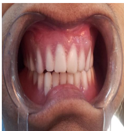
Fig 6: Flangeless denture with preci-clix attachment

cause over contouring and compromised esthetics. Also denture prosthesis may cause interferences due to unfavourable path of insertion and removal . Out of the available options for attachments Ceka Preci-Clix attachments were chosen for the maxillary teeth 13 and 23 because the Preci-clix female