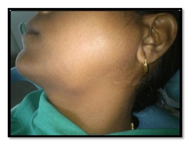
Fig. 1: Two diffuse swellings; i) In left preauricular region; ii) In left sub- mandibular region

USG guided FNAC from left submandibular lymph-node revealed granulomatous reaction comprising of