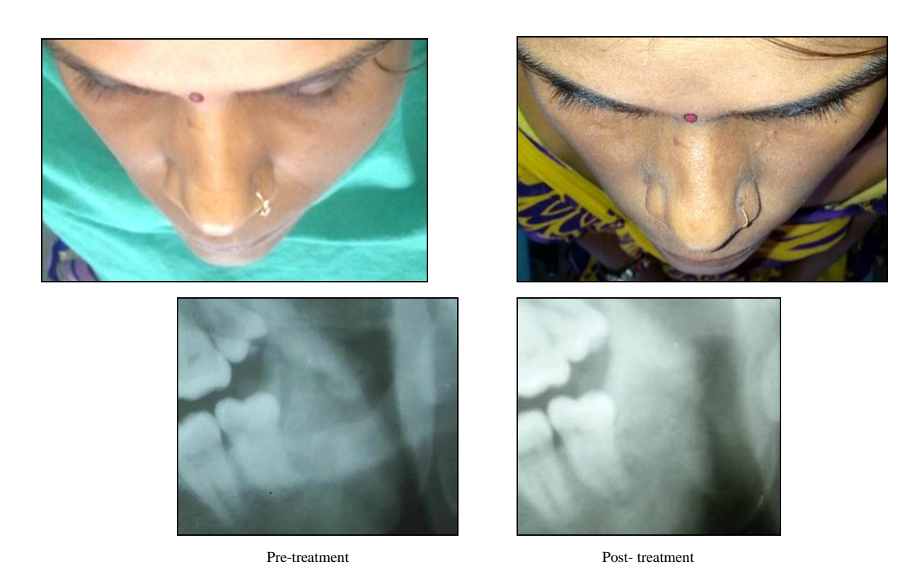
Fig. 4: Follow-up after 6 months; i) Extra-oral features were restored to normal; ii) Radiolucent area within the ramus of mandible also showed evidence of bone healing.

and purulent discharge from duct opening upon milking of gland. Chronic form is characterized clinically by intermittent, often painful swelling.