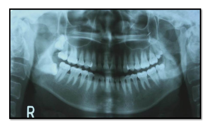
Fig. 2: A single, well-defined, non-corticated radiolucency on left middle 1/3<sup>rd</sup> of ramus, measuring approx. 2×2 cm in size.

by posterior cervical, submandibular and supraclavicular nodes respectively. <sup>6</sup>