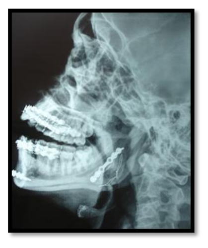
Fig-3, Multiple mandibular angle fracture treated with mini bone plates and trans osseous wiring

patients with mandibular or Le Fort fractures were assessed for occlusion. Those with zygoma fractures were checked for diplopia, enopthalmos and face asymmetry. All the patients were checked for face nervous impairment, operative site infection, and bone union impairment. Operative site infection was defined by a painful swelling or abscess formation with or without drainage from the fracture site. Delayed bone union referred to persistent mobility at the fracture site 8 weeks after osteosynthesis.