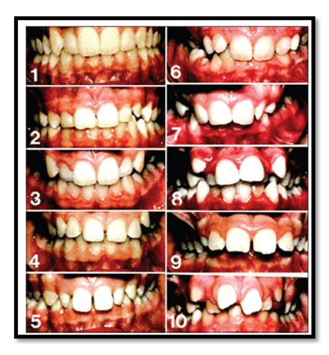
Fig 1: Scan scale of 10 case photographs

photograh (1 to 4) no need, (5 to 7) borderline, (8 to 10) definite need.