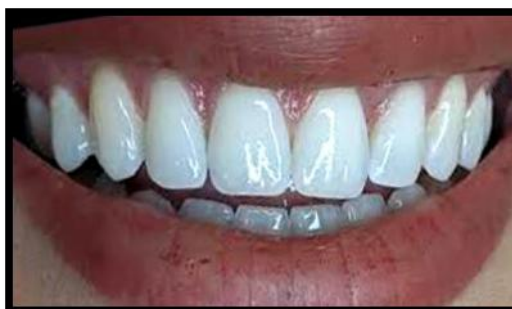
Figure 6: Before Placement

The entire time for jewel to set onto the composite is 20 seconds and takes about 4 minutes to safely fasten the jewel. (Figure.6 and Figure.7)