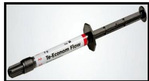
Fig. 4: Te-Econom Flow (Ivoclar, Vivadent)

Small amount of flowable composite (Te-Econom Flow) is applied on the tooth surface. (Figure.4)