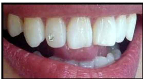
Fig. 7: After Placement