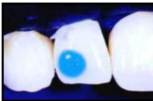
Fig. 2: Etching of tooth

The tooth is etched with 37% phosphoric acid for about 15–20 seconds to enhance the surface area for bonding. Later on the enamel is treated with topical fluoride to remineralize the etched area. (Figure.2)