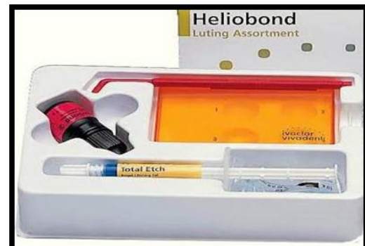
Fig. 3: Heliobond (Ivoclar, Vivadent)

Bonding agent (Heliobond) is applied and then light curing is done for 20 seconds. (Figure.3)