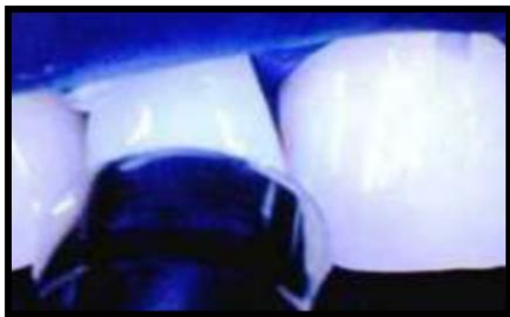
Fig. 5: Light curing is done from all sides

The entire time for jewel to set onto the composite is 20 seconds and takes about 4 minutes to safely fasten the jewel. (Figure.6 and Figure.7)