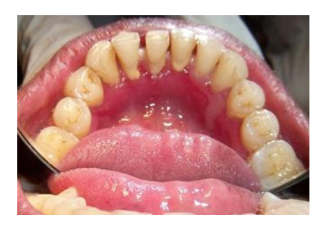
Fig. I (E): Mandibular lingual view