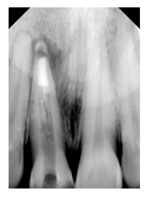
Fig 4a: Resorbable vicryl suture and MTA plug

Post obturation restoration was done using composite resin material (Tetric Ceram, Ivoclar Vivadent, Germany) [Fig 4c].