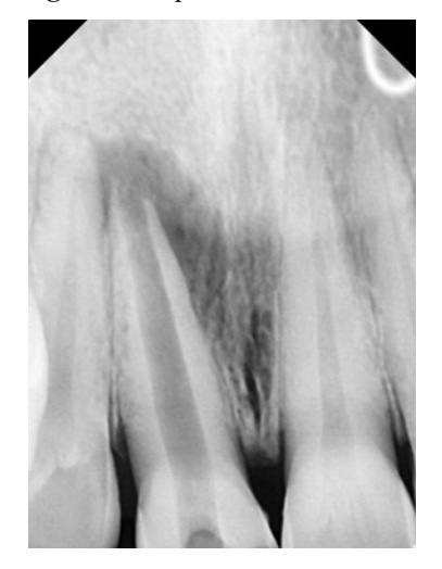
Fig 1b: Pre operative radiograph

Access opening done using round bur (BR 41, Mani, Japan) and Endo safe end bur (ESE 018, SS White, NJ, USA). Apparent working length was estimated with help of periapical radiograph [Fig 2].