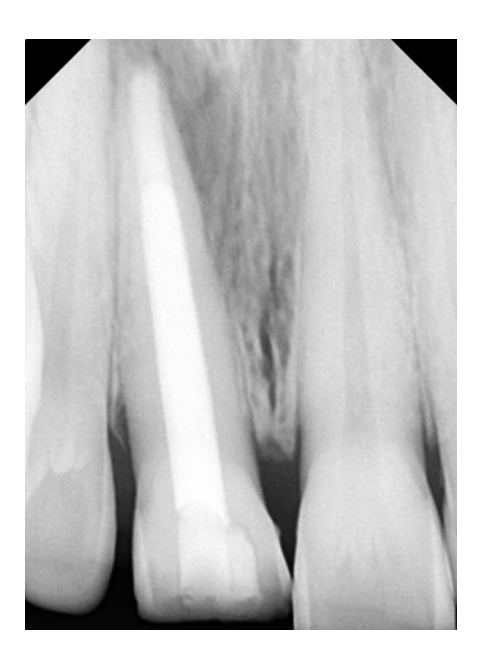
Fig 4b: Post obturation radiograph