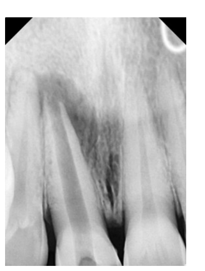
Fig 2: Estimation of working length

Gentle debridement of lateral walls of the canal was done with 80 no K file (Mani, Japan). 3 % sodium hypochlorite (Prime Dental Products, Mumbai, India) was used for irrigation and care was taken so that extrusion was avoided periapically. This was done by the use of 30 gauge side vented irrigation needles (Transcodent GmBH, Germany). 2% CHX (Dentochlor, Ammdent Dental, Chandigarh, India) was used as a final irrigant.