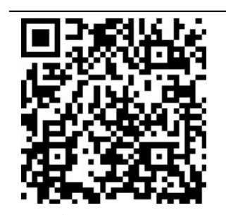
Keywords: pre- menopausal, salivary flow rate, Female