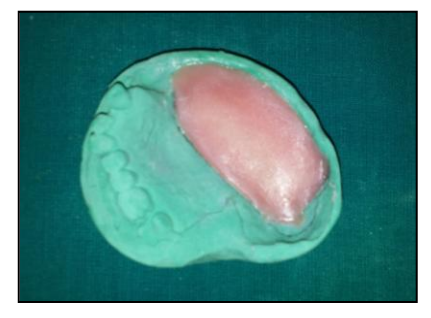
FIG 8: HEAT CURED ACRYLIC