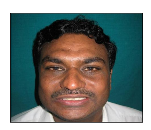
FIG 14: POST OPERATIVE