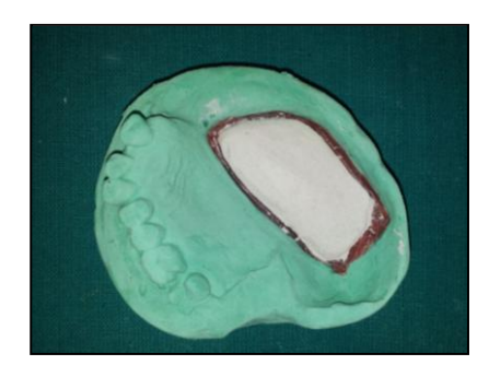
FIG 7: PLASTER INDEX