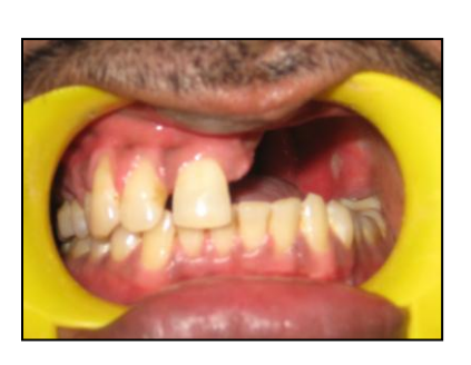
FIG 2: PRE OPERATIVE