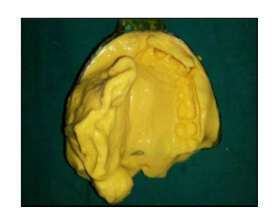
FIG 3: PRELIMINARY IMPRESSION