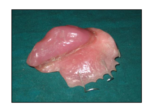
FIG 10: JAW RELATION FIG 11: TRY IN FIG 12: FINISHED PROSTHESIS