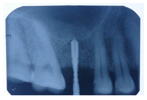
Fig 4 – Pilot drill 1 mm away from the sinus lining