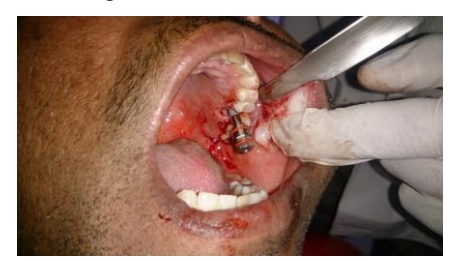
Fig 6 – Implant Placement

confirm the proximity of sinus to the drill ( Fig -4).