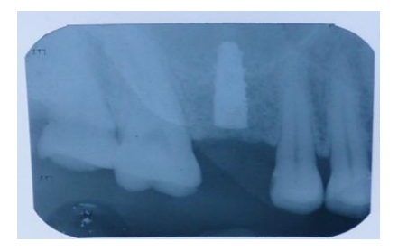
Fig – 7 post operative IOPA