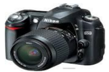
Figure 2) Nikon SLR Digital Camera