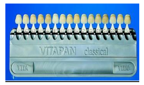
Figure 1) Vitaspan classical shade guide