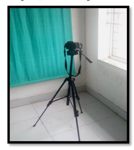
Figure 3) Study Environmemt with natural daylight illumination and Digital camera with adjusted settings fixed on a tripod