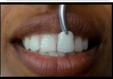
Figure 7) Evaluation of prepared crown for shade matching in both groups; a) Group 1, b) Group 2